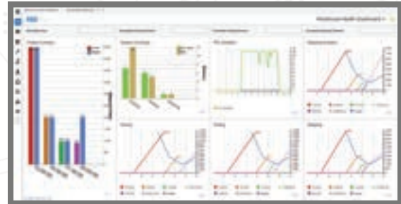
Unified dashboards across all modules.

Embedded BI & Dashboard functionality gives users access to all their data with IntraOne . Dashboards can be enterprise, departmental, or user-specific and can incorporate company KPI's for advanced analytics as well as data from other systems.